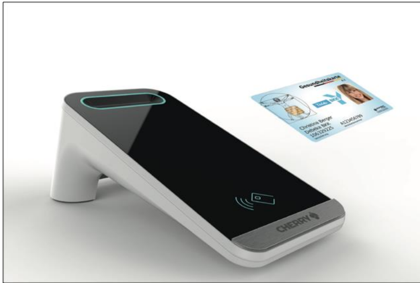
FIGURE 1.1: TOE

The Target of Evaluation (TOE) described in this Security Target is a smart card terminal which fulfils the requirements to be used with the German electronic Health Card (eHC) and the German Health Professional Card (HPC) based on the regulations of the German healthcare system. Please refer to see [gemSpec_KT] for further information about card compatibility. This terminal is based on the specification for a “Secure Interoperable ChipCard terminal” ([SICCT]) extended and limited by the specifications for the e-Health terminal itself (see [gemSpec_KT]).