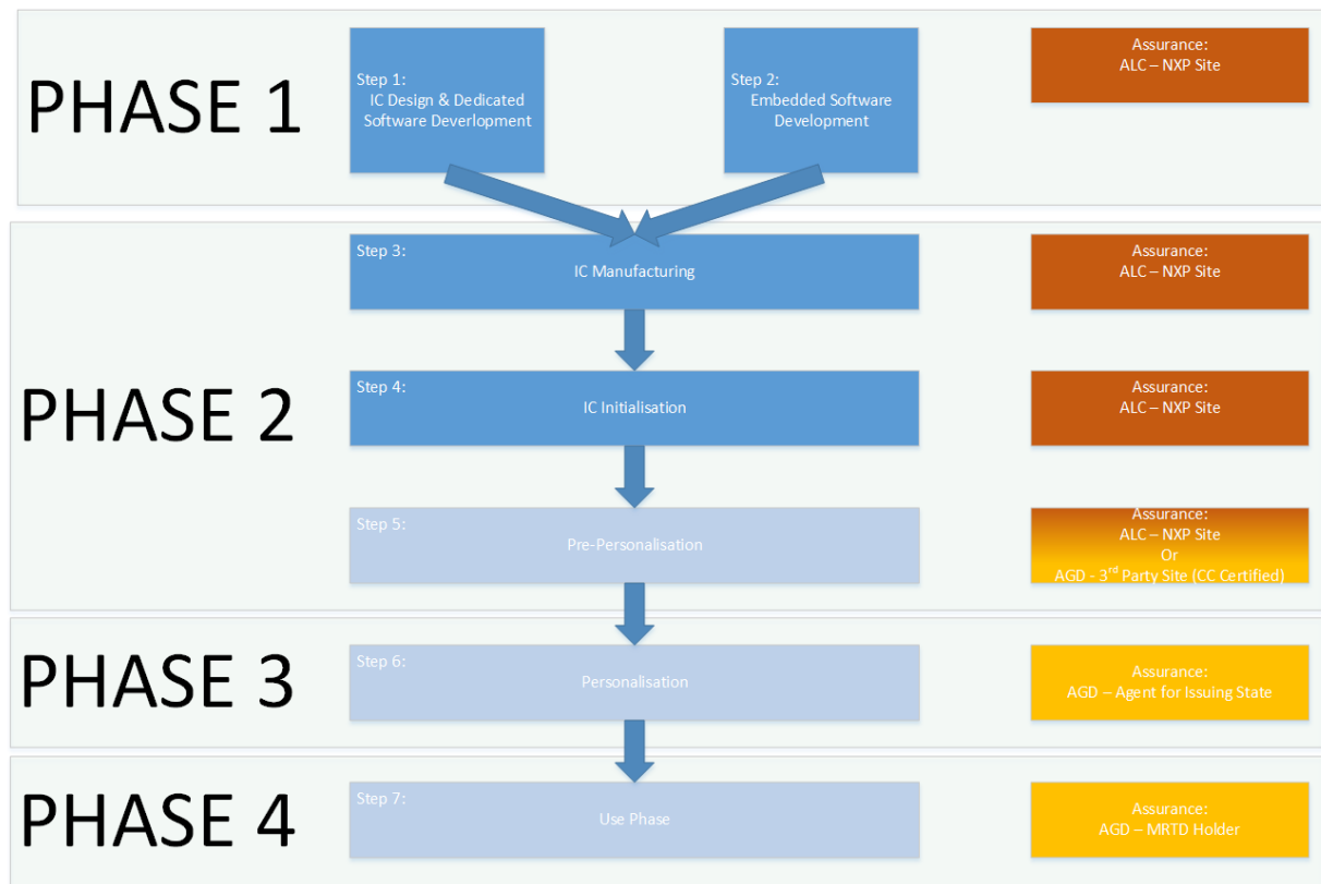
Fig 2. TOE LifeCycle

During the step Pre-Perso, the MRTD manufacturer